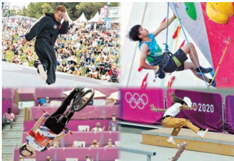
Breaking, BMX freestyle, sport climbing and skateboarding are popular with young people.